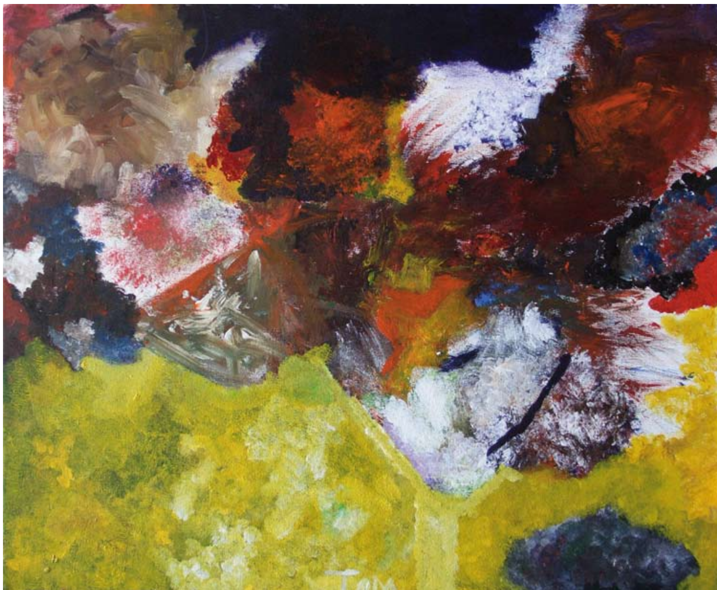
La menace 54 x 65 cm