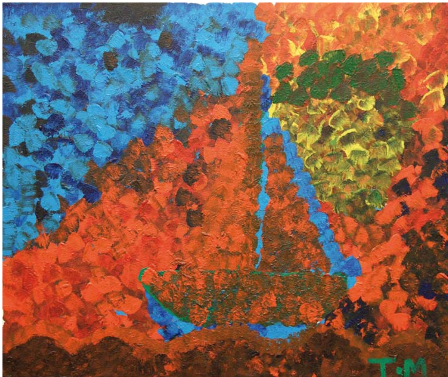
Bateau dans la tempête 50 x 60 cm