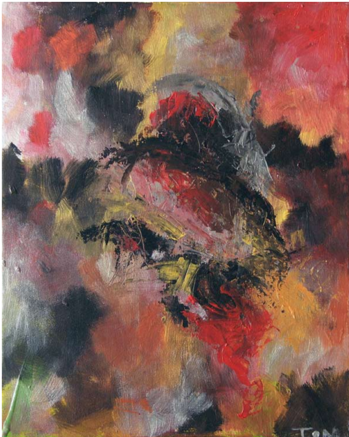
Tourbillon 46 x 38 cm