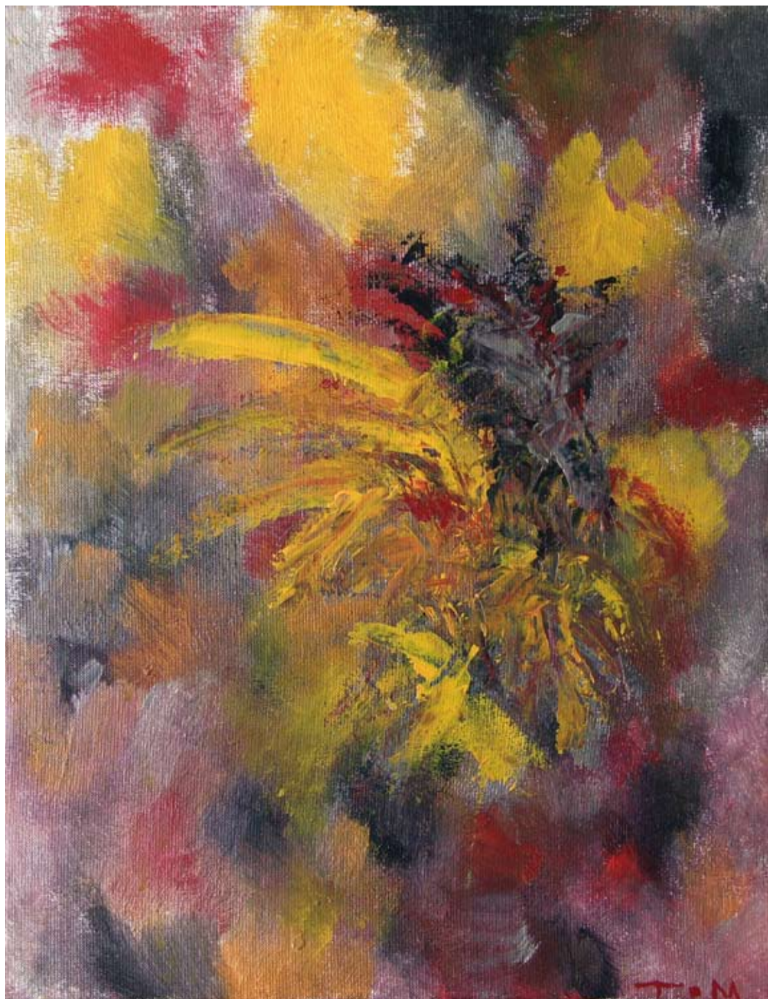
Feu d'artifice 50 x 40 cm