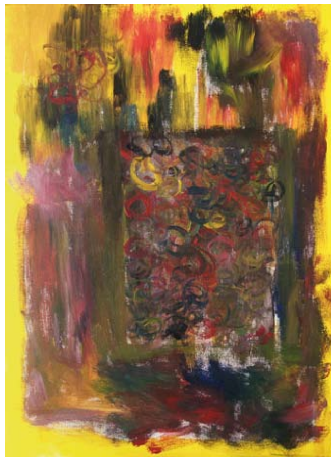
Magique 50 x 70 cm