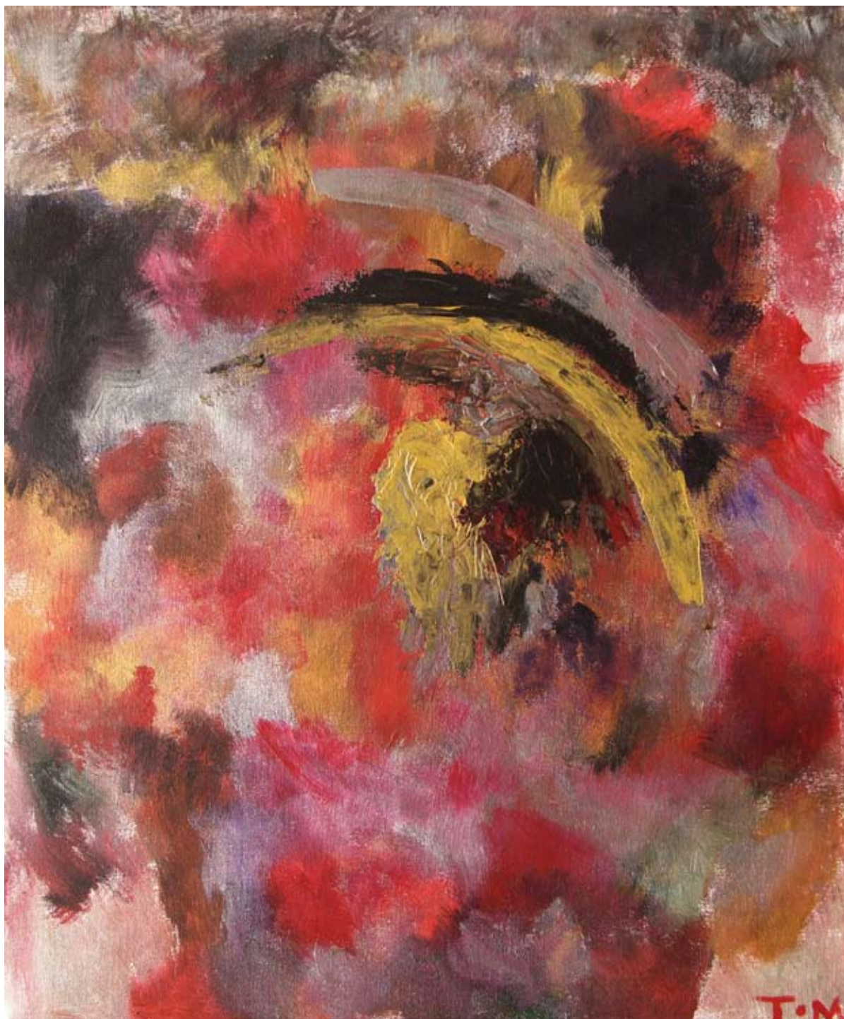
L'orage 50 x 60 cm