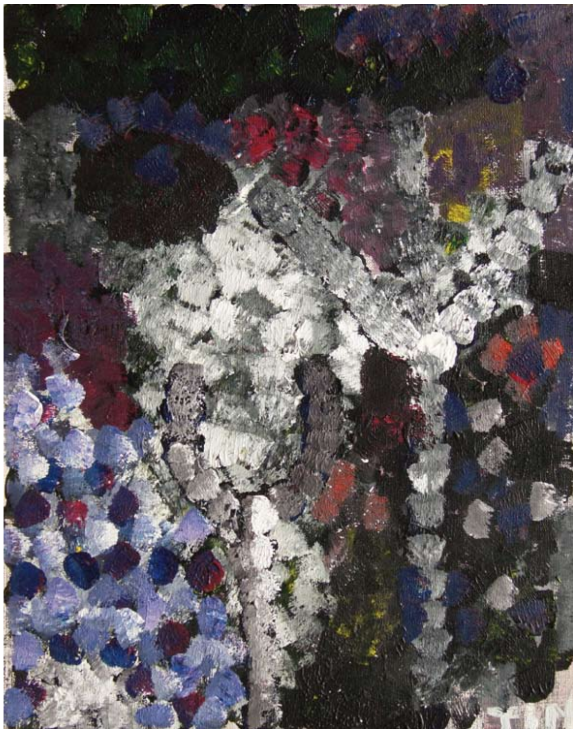
Arbres dans la nuit 46 x 38 cm