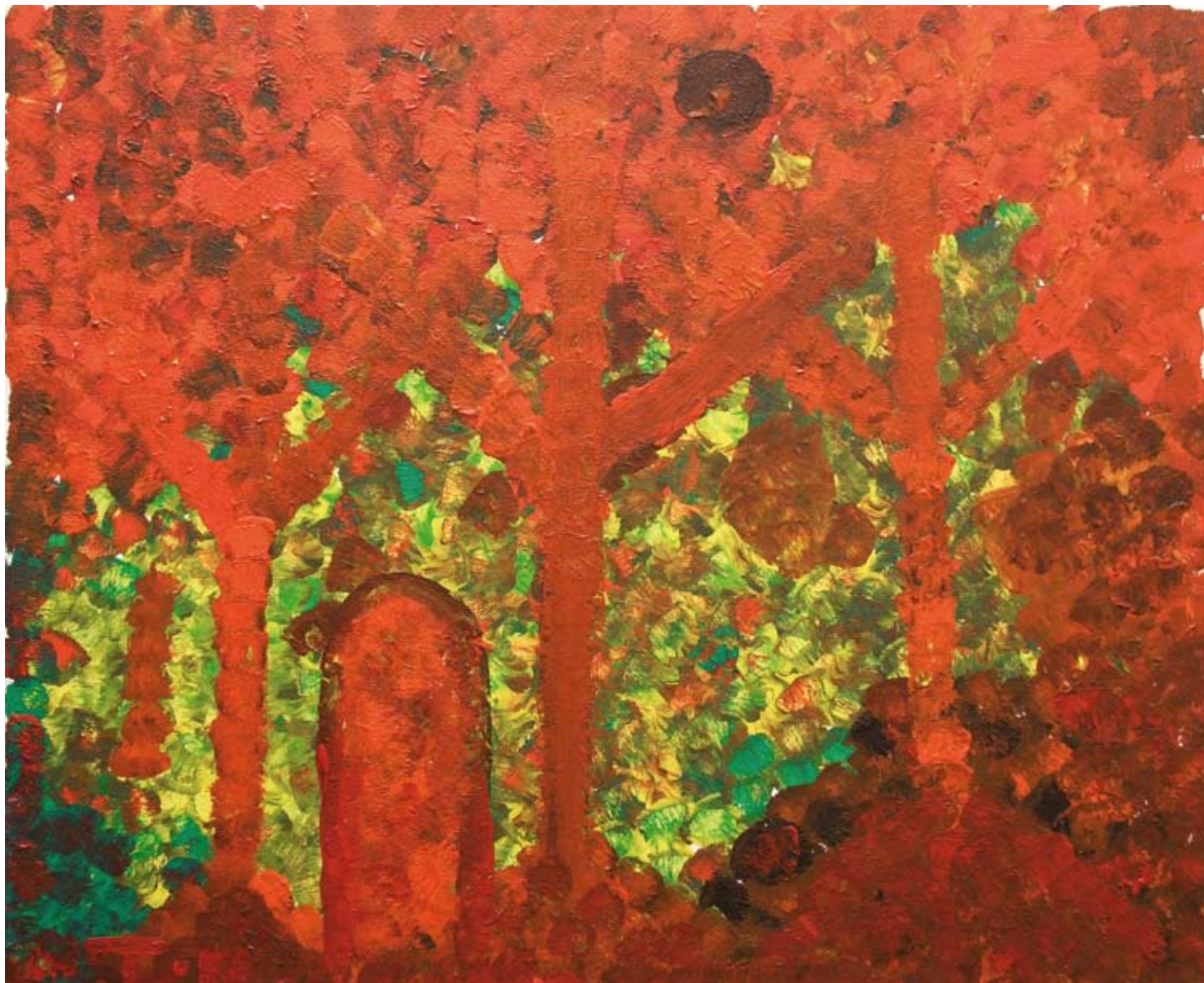
Maisons magiques 50 x 60 cm