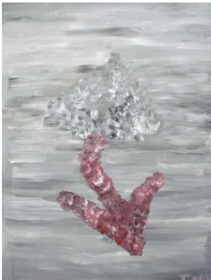
La fuite 81 x 60 cm