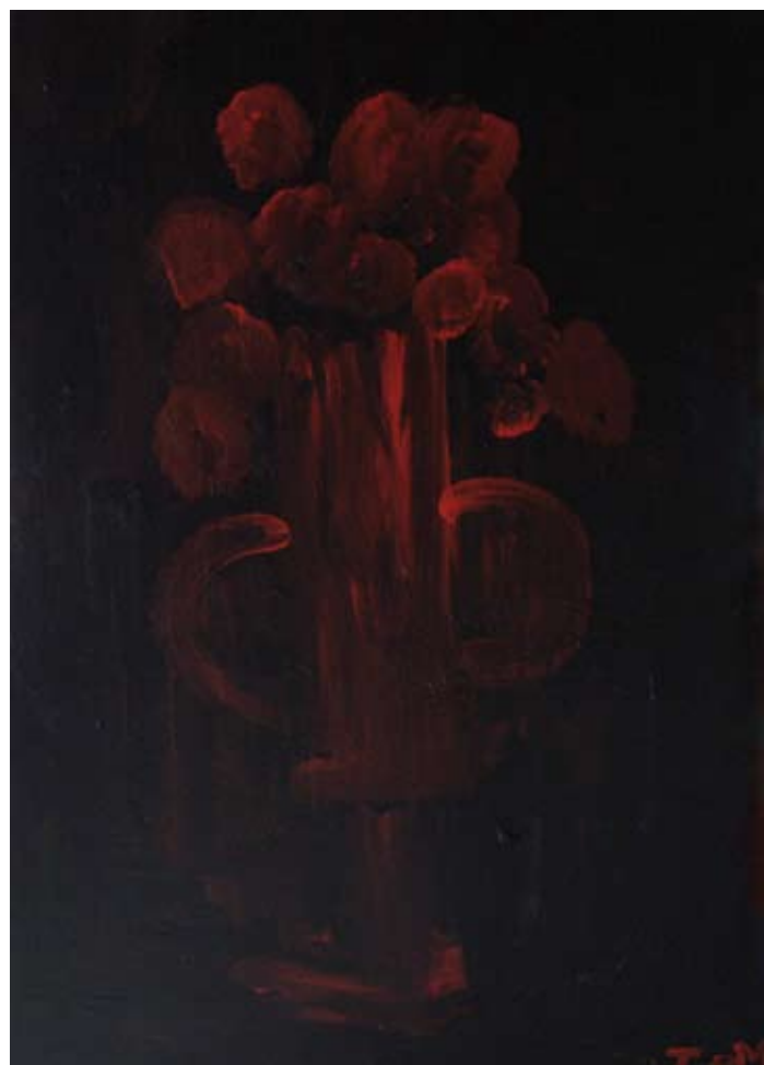
Fleurs dormantes 80 x 60 cm