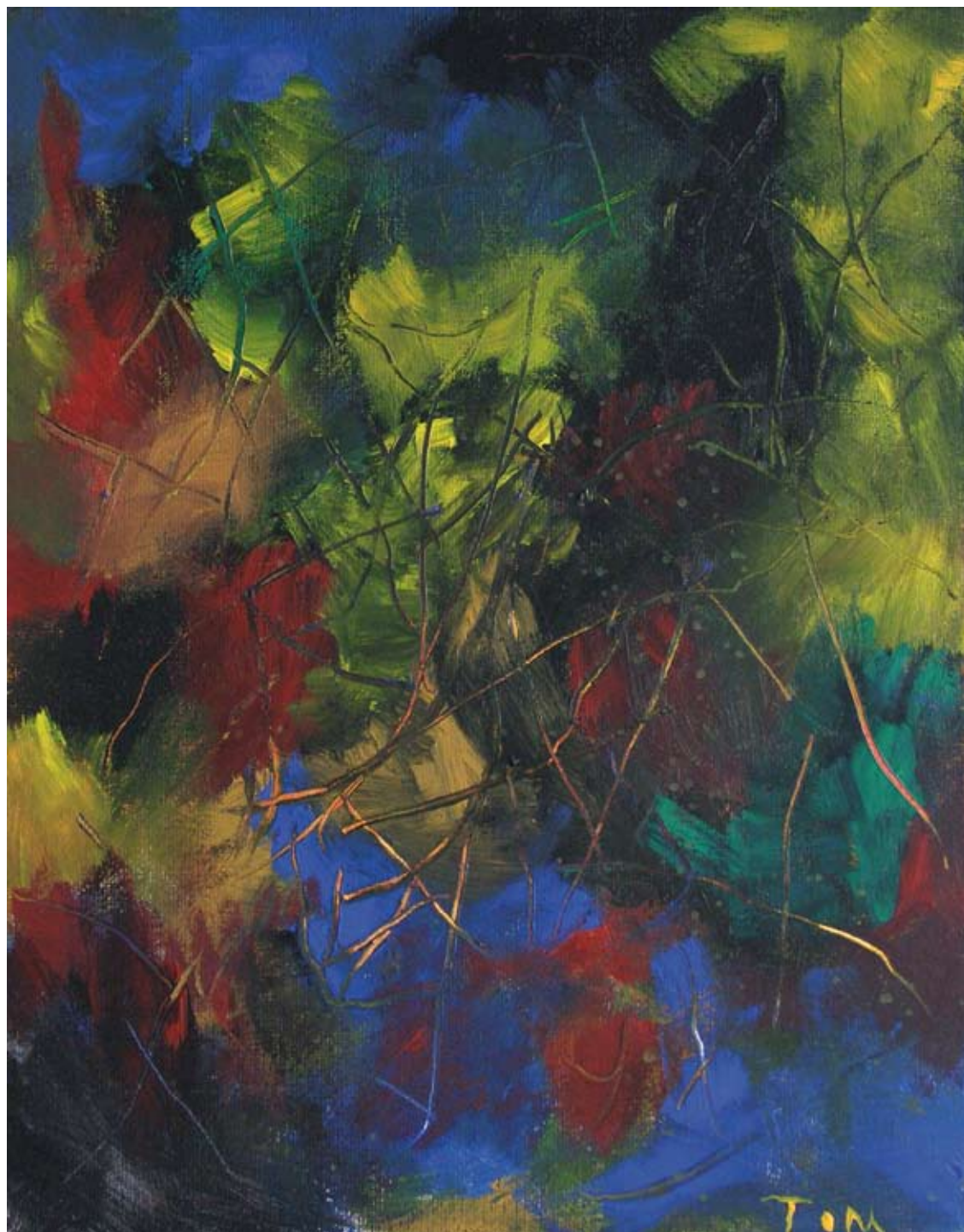
Araignée sauvage 50 x 40 cm